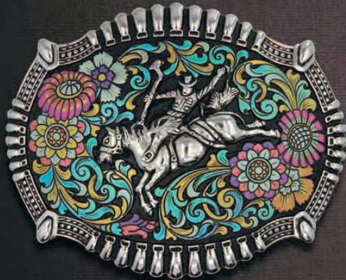
$249-AUD LIMITED EDITION of 300