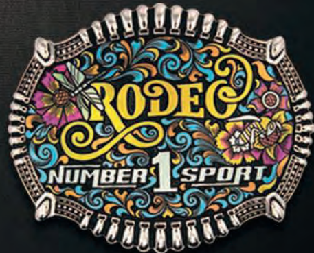
$257-AUD LIMITED EDITION of 500