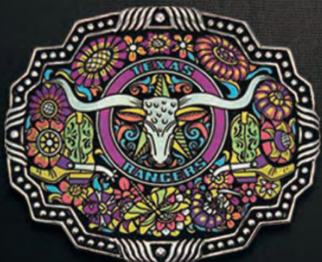
$460-AUD LIMITED EDITION of 50