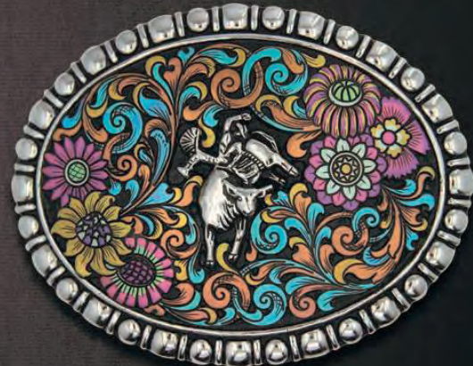
$249-AUD LIMITED EDITION of 300