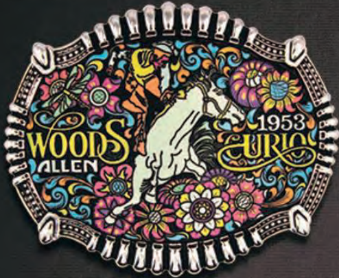
$257-AUD LIMITED EDITION of 500

Hand engraved TITANIUM . Hand coloring on each piece.